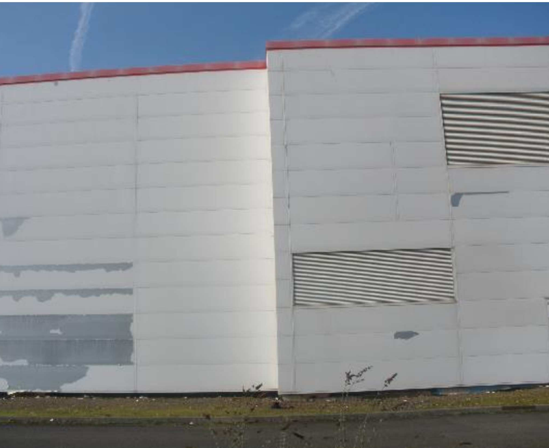
Weather damage to external paintwork on t side of the building