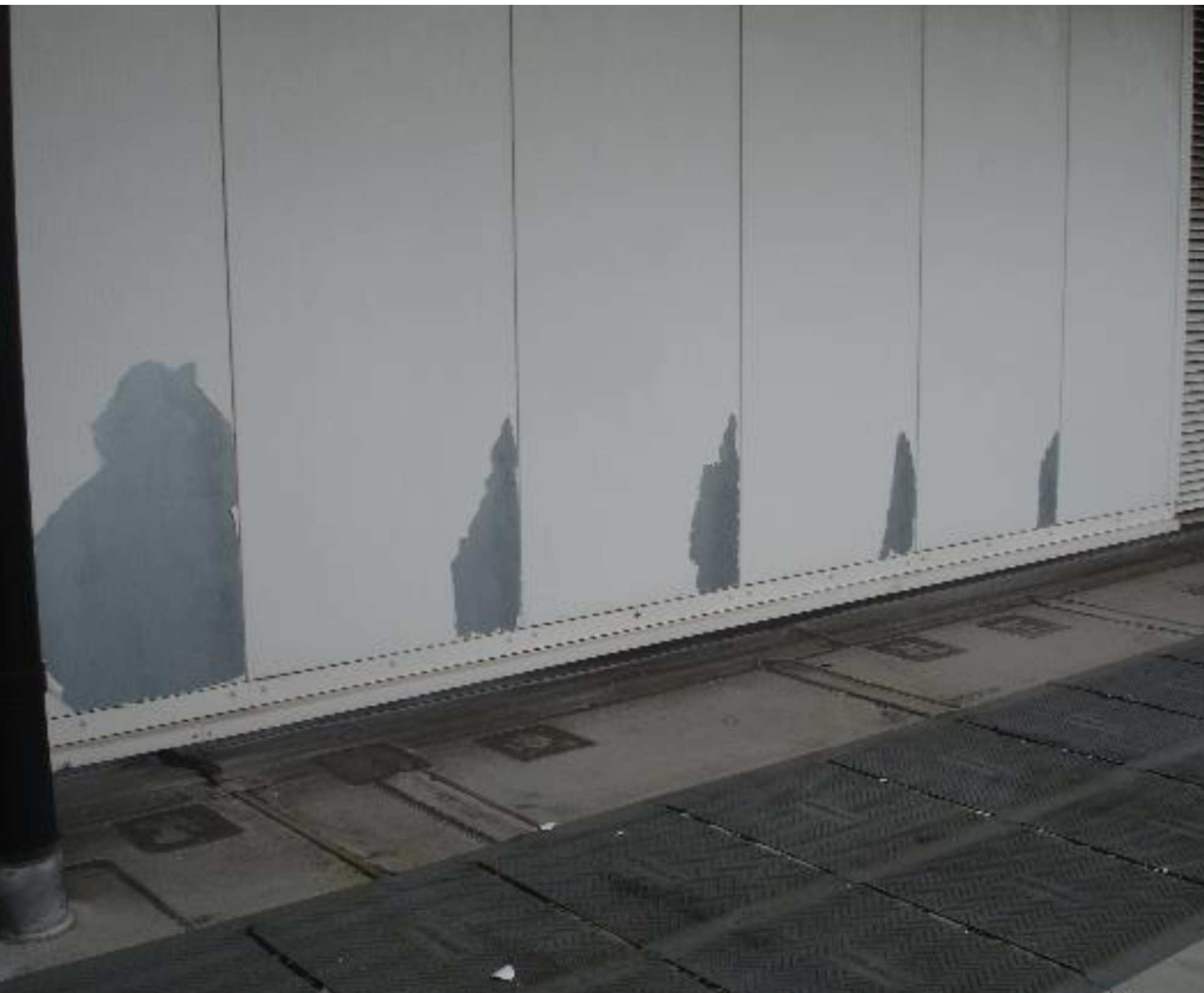
Weather damage to external paintwork above flat roofing