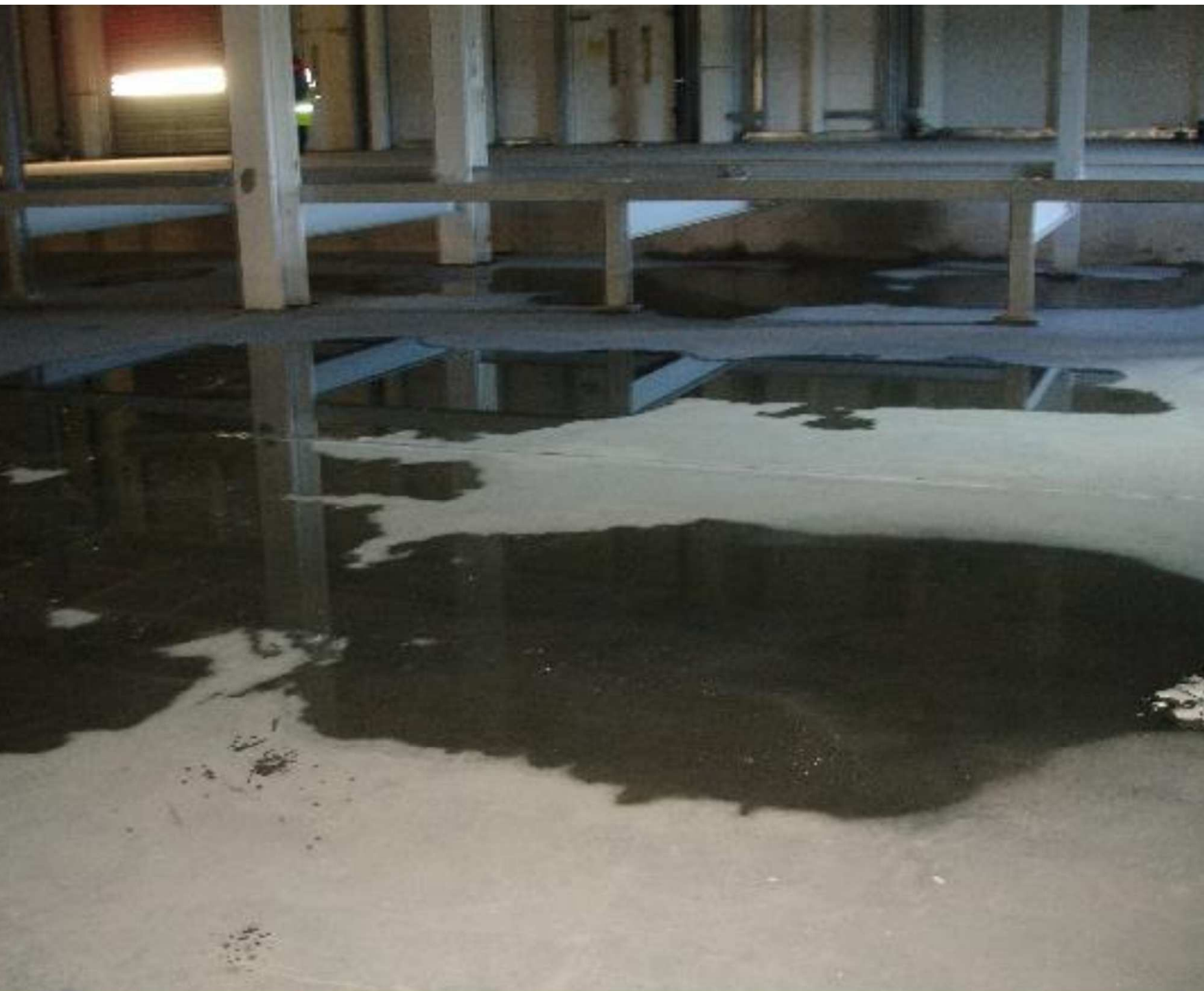
Pools of water on internal concrete floors due to leaks in the building